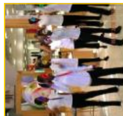
Macy's Shop for a Cause