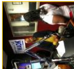
One On One at WAOK