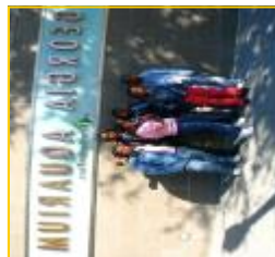
GA Aquarium Tour