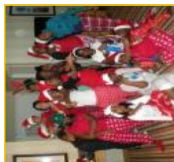
Red Pajama Celebration