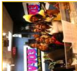
V103 Studio Tour

Overview The Director Stir It Up Girls! Activities Images Supporters Donations Contact Us