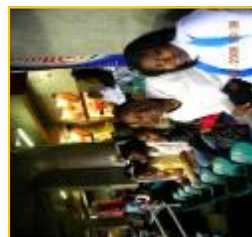
Atlanta Braves Game