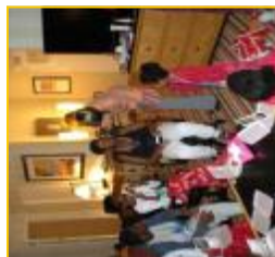
Red Pajama Makeover